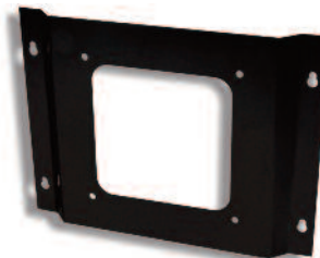
Optional Mounting Bracket